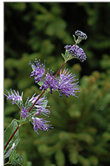
Blue Mist Caryopteris flowers