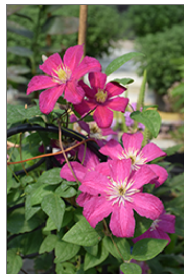
Barbara Harrington Clematis flowers Photo courtesy of NetPS Plant Finder