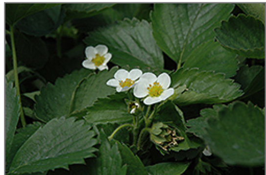
Everbearing Strawberry flowers