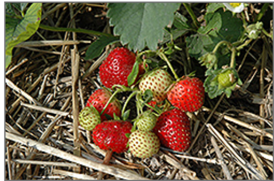
Everbearing Strawberry fruit

Everbearing Strawberry features dainty white daisy flowers with yellow eyes along the stems from late spring to early summer. Its tomentose round compound leaves remain green in color throughout the season. It features an abundance of magnificent cherry red berries from early to late summer.