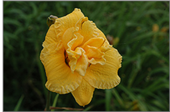
Double Dream Daylily flowers