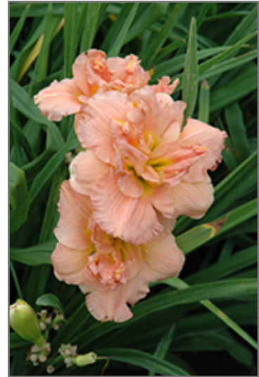
Siloam Double Classic Daylily flowers