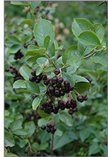
Black Chokeberry fruit