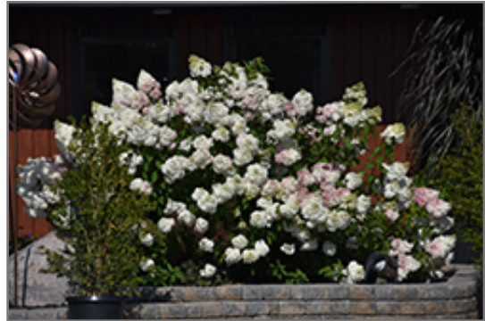
Vanilla Strawberry Hydrangea in bloom

This shrub performs well in both full sun and full shade. It prefers to grow in average to moist conditions, and shouldn't be allowed to dry out. It is not particular as to soil type or pH. It is highly tolerant of urban pollution and will even thrive in inner city environments. Consider applying a thick mulch around the root zone in winter to protect it in exposed locations or colder microclimates. This is a selected variety of a species not originally from North America.