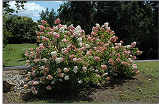
Vanilla Strawberry Hydrangea in bloom