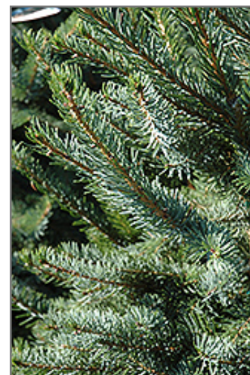
Brun's Spruce foliage