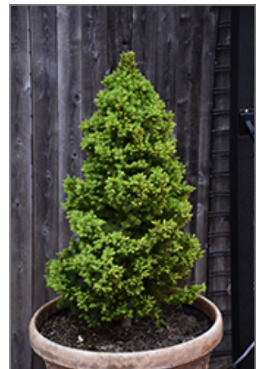
Rainbow's End Spruce