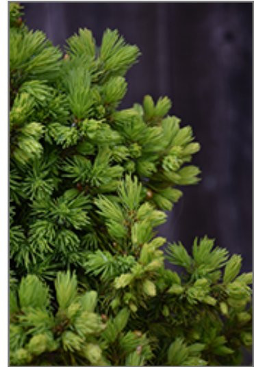
Rainbow's End Spruce foliage

* This is a 'special order' plant - contact store for details