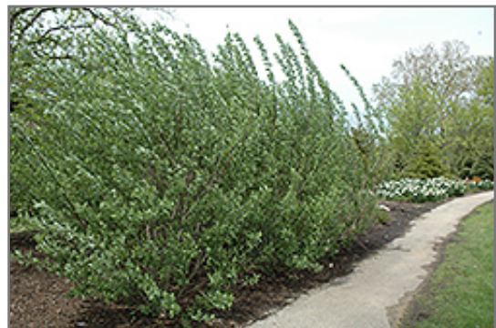
French Pussy Willow