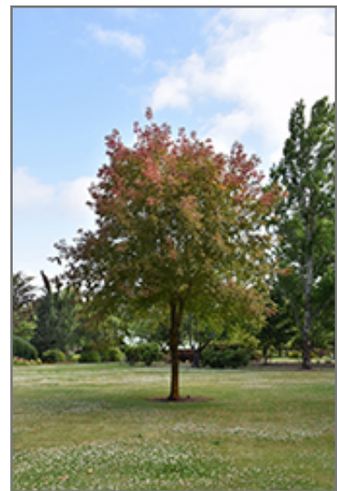
Sensation Boxelder