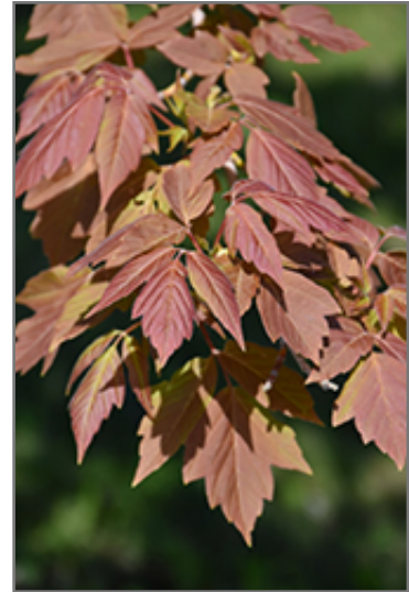
Sensation Boxelder foliage