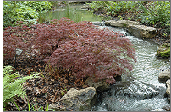
Inaba Shidare Cutleaf Japanese Maple

Inaba Shidare Cutleaf Japanese Maple will grow to be about 8 feet tall at maturity, with a spread of 8 feet. It tends to be a little leggy, with a typical clearance of 2 feet from the ground, and is suitable for planting under power lines. It grows at a medium rate, and under ideal conditions can be expected to live for 60 years or more.