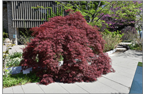
Inaba Shidare Cutleaf Japanese Maple

Inaba Shidare Cutleaf Japanese Maple is recommended for the following landscape applications;