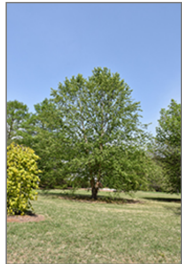
Dura Heat River Birch