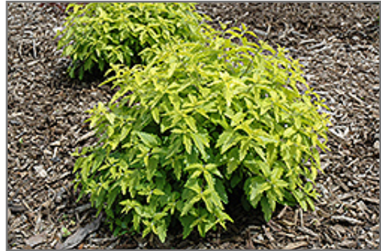
Sunshine Blue Caryopteris

Sunshine Blue Caryopteris is recommended for the following landscape applications;