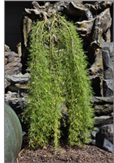
Walker Weeping Peashrub