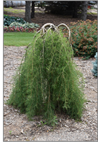
Walker Weeping Peashrub

This shrub does best in full sun to partial shade. It prefers dry to average moisture levels with very well-drained soil, and will often die in standing water. It is considered to be drought-tolerant, and thus makes an ideal choice for xeriscaping or the moisture-conserving landscape. It is not particular as to soil type or pH, and is able to handle environmental salt. It is highly tolerant of urban pollution and will even thrive in inner city environments. This is a selected variety of a species not originally from North America.