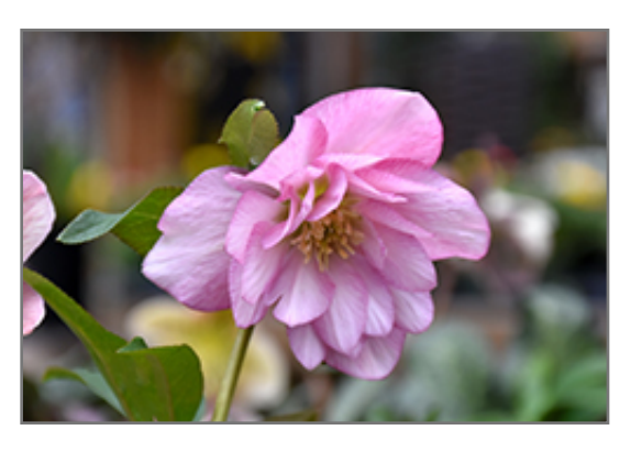
Cotton Candy Hellebore flowers

Cotton Candy Hellebore is recommended for the following landscape applications;