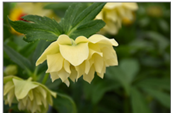
Golden Lotus Hellebore flowers