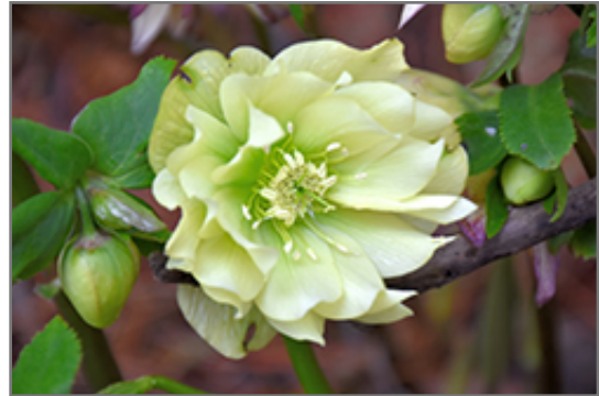
Golden Lotus Hellebore flowers

Golden Lotus Hellebore is recommended for the following landscape applications;