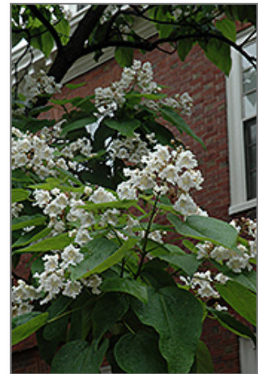
Northern Catalpa flowers