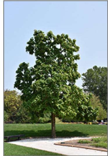
Northern Catalpa