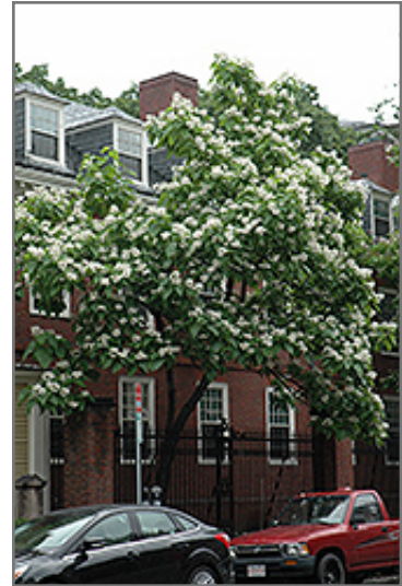
Northern Catalpa in bloom

This tree does best in full sun to partial shade. It is an amazingly adaptable plant, tolerating both dry conditions and even some standing water. It is not particular as to soil type or pH, and is able to handle environmental salt. It is highly tolerant of urban pollution and will even thrive in inner city environments. This species is native to parts of North America.