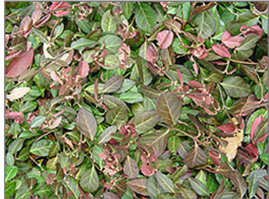
Purpleleaf Wintercreeper foliage

Purpleleaf Wintercreeper is recommended for the following landscape applications;