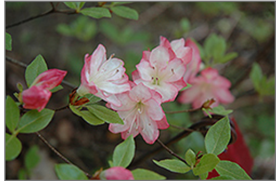
Apple Blossom Azalea flowers

Apple Blossom Azalea will grow to be about 3 feet tall at maturity, with a spread of 4 feet. It has a low canopy. It grows at a slow rate, and under ideal conditions can be expected to live for 40 years or more.