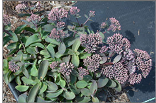
Chocolate Drop Stonecrop flower buds

Chocolate Drop Stonecrop is a fine choice for the garden, but it is also a good selection for planting in outdoor pots and containers. It is often used as a 'filler' in the 'spiller-thriller-filler' container combination, providing a mass of flowers and foliage against which the larger thriller plants stand out. Note that when growing plants in outdoor containers and baskets, they may require more frequent waterings than they would in the yard or garden.