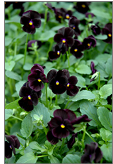
Sorbet Black Delight Pansy flowers

This plant will require occasional maintenance and upkeep, and should only be pruned after flowering to avoid removing any of the current season's flowers. Deer don't particularly care for this plant and will usually leave it alone in favor of tastier treats. Gardeners should be aware of the following characteristic(s) that may warrant special consideration;