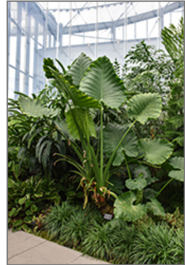
Elephant's Ear

This plant is native to the tropics and prefers growing in moist environments with evenly warm conditions all year round. In our climate, it is usually grown as an outdoor annual in the garden or in a container. If you want it to survive the winter, it can be brought in to the house and provided with special care, and then returned to the garden the following season. In its preferred tropical habitat, it can grow to be around 12 feet tall at maturity, with a spread of 10 feet. However, when grown as an annual or when overwintered indoors, it can be expected to perform differently, and its exact height and spread will depend on many factors; you may wish to consult with our experts as to how it might perform in your specific application and growing conditions.