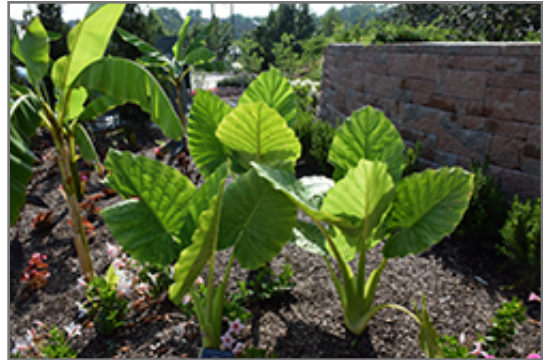
Elephant's Ear

Elephant's Ear is a fine choice for the garden, but it is also a good selection for planting in outdoor pots and containers. Its large size and upright habit of growth lend it for use as a solitary accent, or in a composition surrounded by smaller plants around the base and those that spill over the edges. It is even sizeable enough that it can be grown alone in a suitable container. Note that when growing plants in outdoor containers and baskets, they may require more frequent waterings than they would in the yard or garden. Be aware that in our climate, this plant may be too tender to survive the winter if left outdoors in a container. Contact our experts for more information on how to protect it over the winter months.