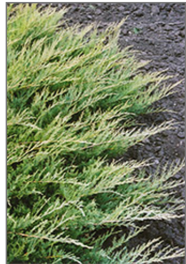
Broadmoor Juniper foliage