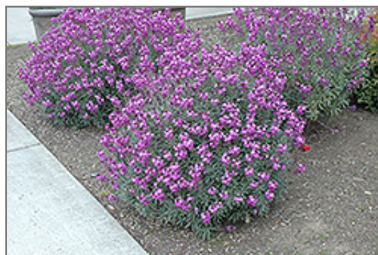
Bowles Mauve Wallflower in bloom