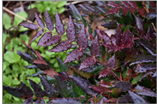
Oregon Grape Holly foliage

This shrub does best in partial shade to shade. It does best in average to evenly moist conditions, but will not tolerate standing water. It is not particular as to soil pH, but grows best in rich soils. It is somewhat tolerant of urban pollution, and will benefit from being planted in a relatively sheltered location. Consider applying a thick mulch around the root zone in winter to protect it in exposed locations or colder microclimates. This species is native to parts of North America.