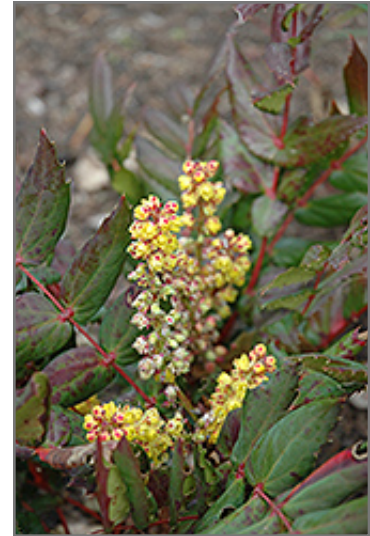
Oregon Grape Holly flowers

Oregon Grape Holly is a multi-stemmed evergreen shrub with a ground-hugging habit of growth. Its average texture blends into the landscape, but can be balanced by one or two finer or coarser trees or shrubs for an effective composition.