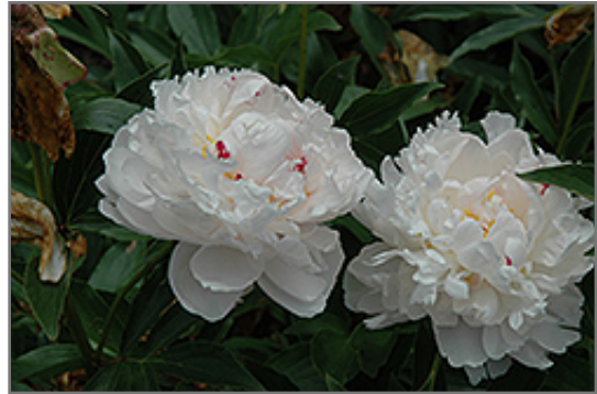
Avalanche Peony flowers