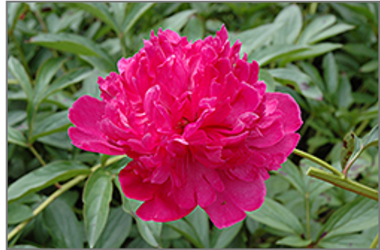
Felix Crousse Peony flowers